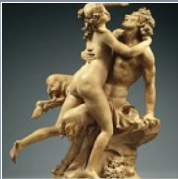
A Satyr & Nymph