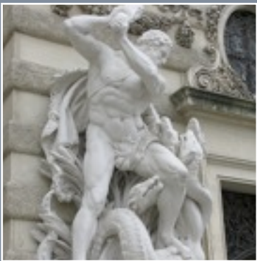
Hercules & the Hydra